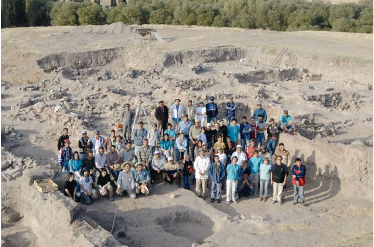
9. All Members of the Excavation Team and Workers from Çağırkan Village in the 22 nd Season of Kaman-Kalehöyük