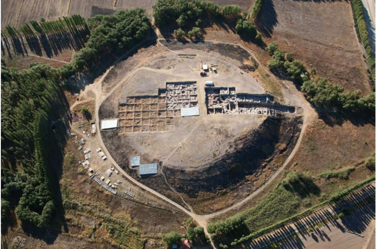
1. An Overview of Kaman-Kalehöyük in 2007