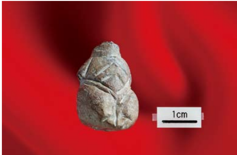
6. Clay figurines: 07000017, Neolithic period (Kaman-Kalehöyük)