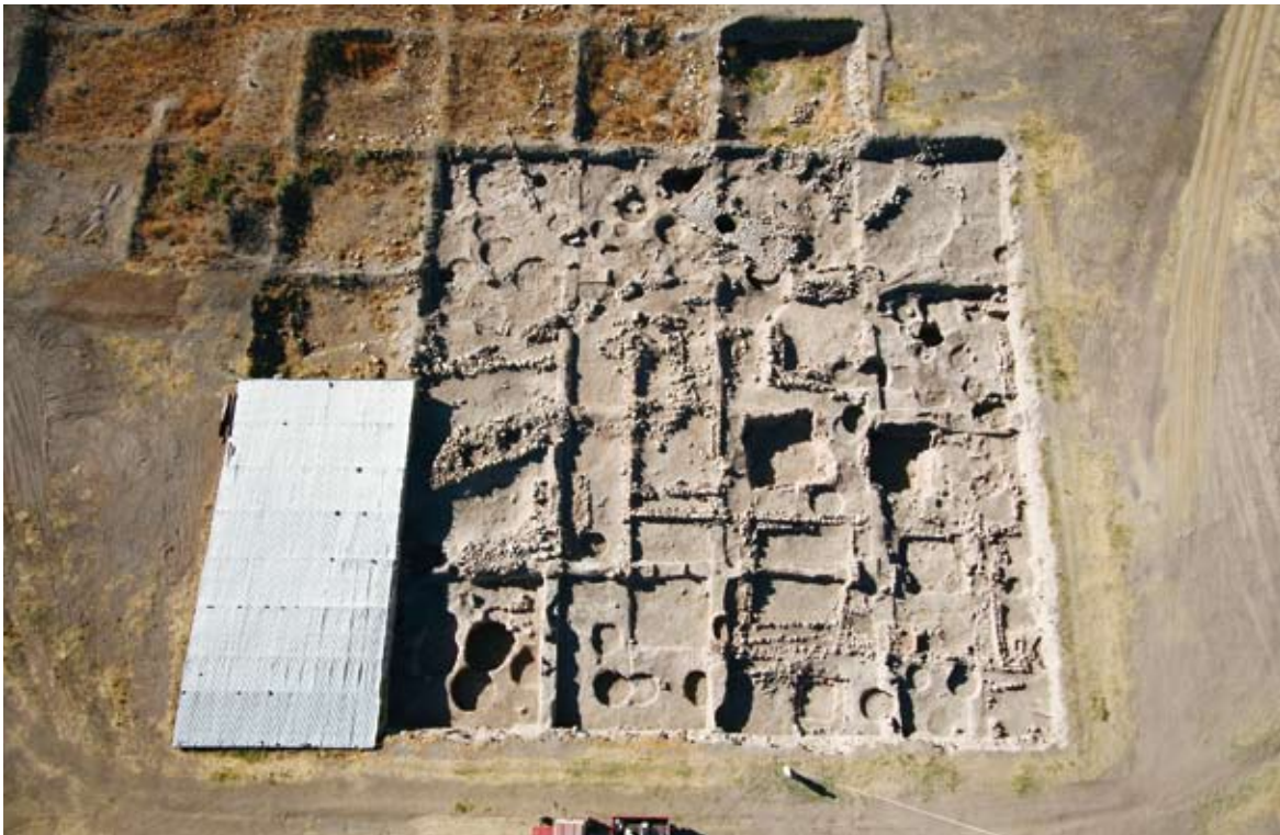
5. An Overview of the South Sector in 2007 (Kaman-Kalehöyük)