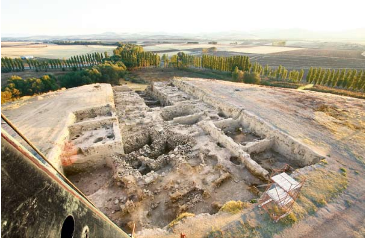
4. An Overview of the North Sector in 2007 (Kaman-Kalehöyük)