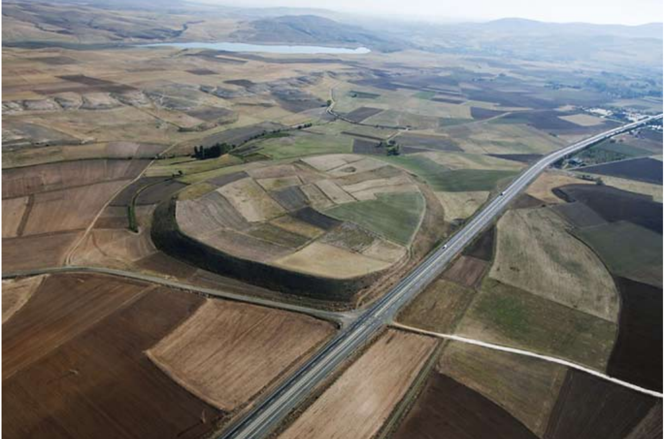
2. An Overview of Yassıhöyük in 2007