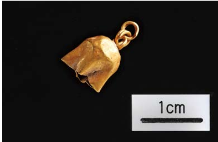
7. Gold personal ornament: 07000195, Stratum IIa (Kaman-Kalehöyük)